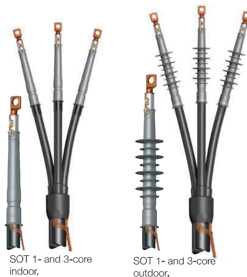
SOT 1- and 3-core indoor.

The terminations are supplied in kits for 1- or 3-phase cables.