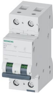
Miniature circuit breaker 400 V 10kA, 2-pole, B, 2A