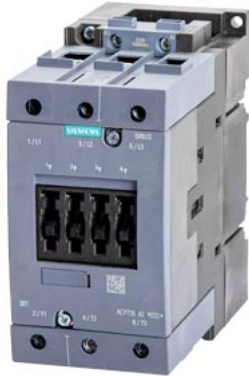
Contactora AC 220 V 50/60 HZ AC3 30 kW 400 V 3-pole, size S3 screw terminal